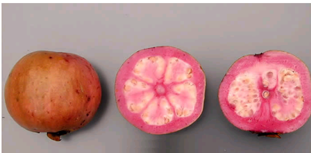
Red guava ( Psidium guyava ), a multinutrient superfruit. You might first detect its sweet fragrance even before seeing it!

Then visit twitter.com/superfruitsbook where you need to click on "Follow" to be linked into Berry Doctor "tweets" on superfruit news.