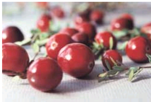
Cranberries ( Vaccinium macrocarpon L.), the only superfruit with a health claim (but only in France)