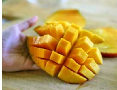
Mango ( Mangifera indica L.). A great package of superfruit nutrients.

red raspberries blackberries strawberries